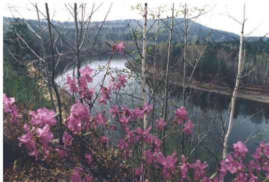
May on the Ingoda River

Siberian Bridges, Inc. 3212 18th Avenue South Minneapolis, Minnesota 55407 www.siberianbridges.org info@siberianbridges.org