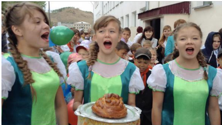
Traditional Russian greeting of bread and salt