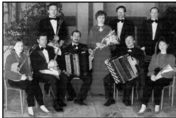
The Budashkin Russian Folk Instrument Ensemble of Chita, Russia. Musical Bridges will bring them on tour in the US in October 1997.