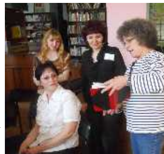
With Pushkin Library staff

Chita —First up was the Pushkin Library where we were presented with an award from the Ministry of Education for our