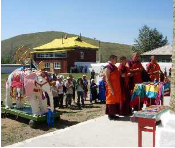
Ceremony on the Zabaikalyan steppes