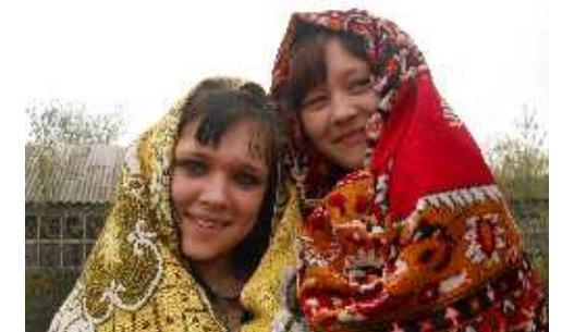
At the Children's Home summer camp

Email for paperless receipt of SB materials