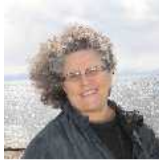
On Lake Baikal