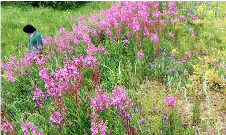
Summer at the Ivano-Arakhlei Regional Park