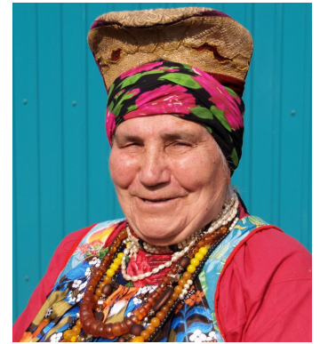
Old Believer of Krasny Chikoy