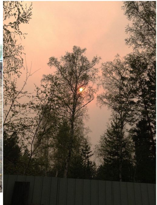
Smoke from regional wildfires make the sun red in mid-afternoon. It was the worst spring wildfire season in memory.