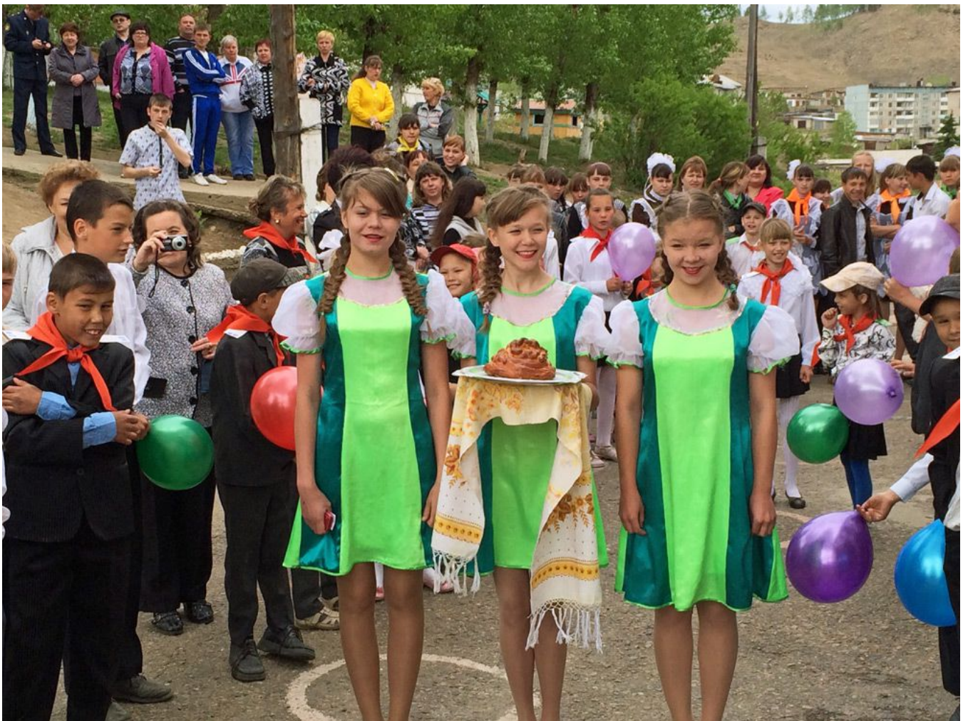
The Children's Home greets us in June.

Page 12: Siberian Bridges info: Donations, Contacts