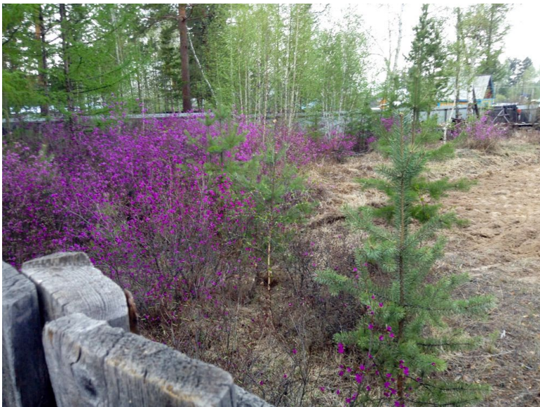
Bagulnik in bloom, May 2015. This endemic wild rhododendron is the symbol of Zabaikalye and a harbinger of coming summer.