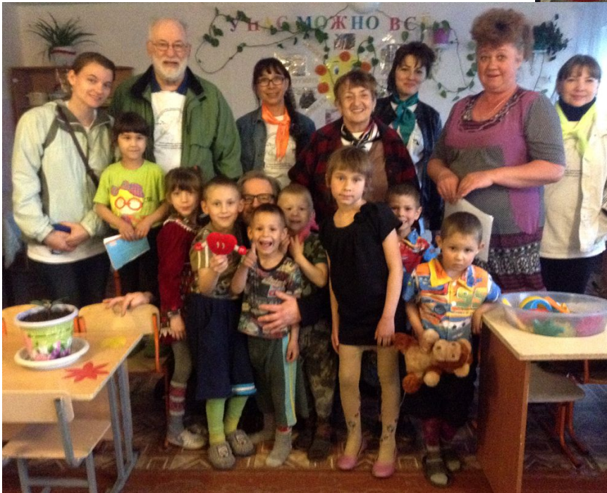
In the Children's Home nursery