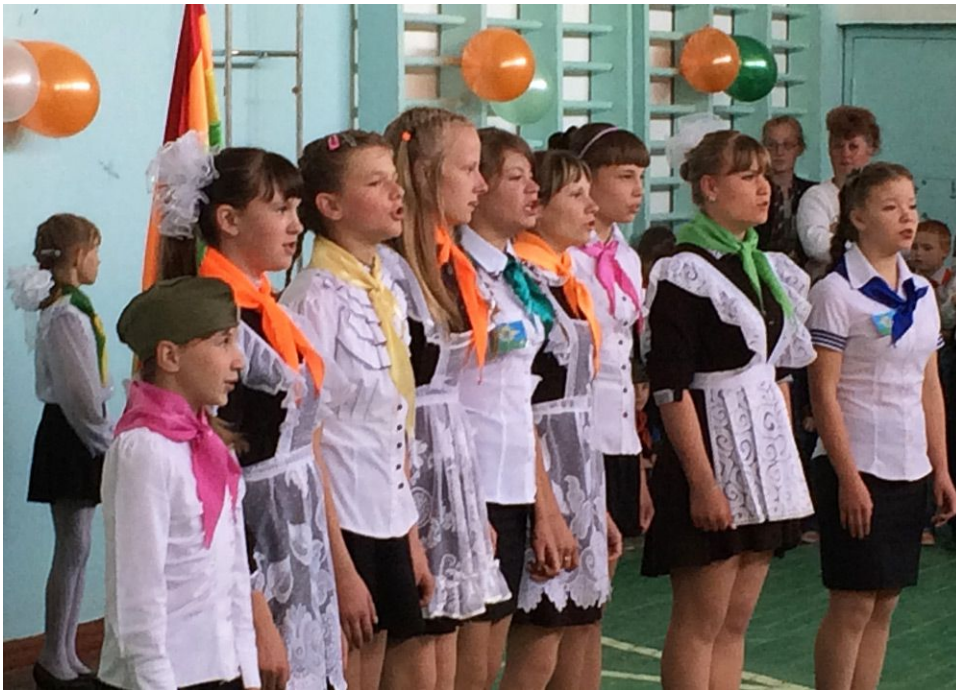
Singing the Children's Home anthem. Girls in aprons are graduating seniors.