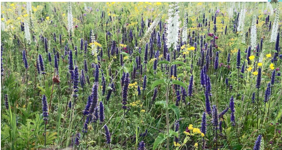
Summer flowers, Ivano-Arakhlei Regional Park near Chita.

Siberian Bridges is a 501c3 non-profit registered in Minnesota. Donations are 100% tax-deductible.