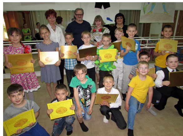
7-8 year old English students receive certificates on the last day of class in a private afterschool in the "KSK" district near Chita.

schools appearing in Chita. One was for adults, the other for small children. There is interest in guest native speaking teachers for summer school, so we are preparing an application process for the schools to let us know what they need and can offer. We hope to find some teachers for them among UMN students and readers of this newsletter.