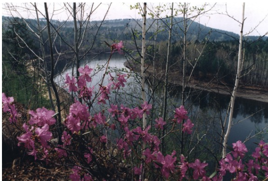
May on the Ingoda River

Siberian Bridges, Inc. 3212 18th Avenue South Minneapolis, Minnesota 55407 www.siberianbridges.org info@siberianbridges.org