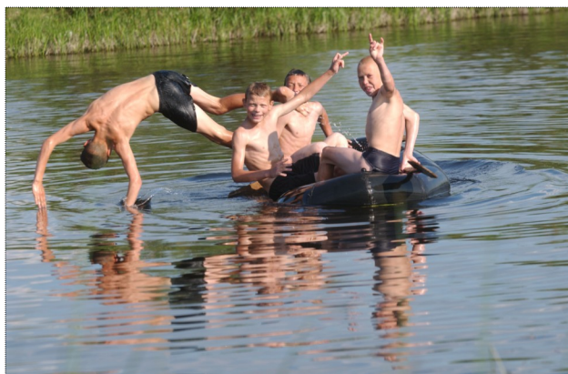
Summer is around the bend — by E. Epanchintsev