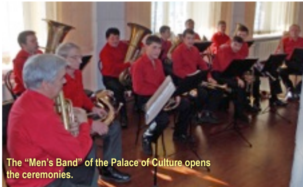
The "Men's Band" of the Palace of Culture opens the ceremonies.