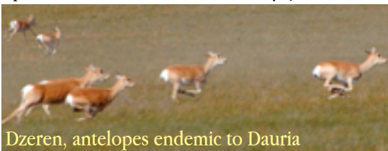
Dzeren, antelopes endemic to Dauria

A place we'll visit on the Taste of Zabaikalye June 2014 tour