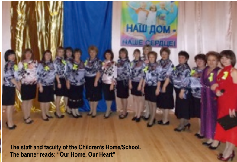
The staff and faculty of the Children's Home/School. The banner reads: "Our Home, Our Heart"