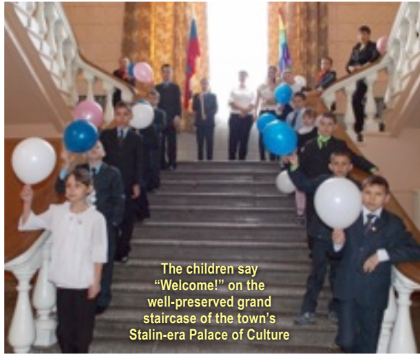
The children say "Welcome!" on the well-preserved grand staircase of the town's Stalin-era Palace of Culture