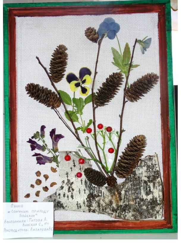
Children's Center Art for the Save Lake