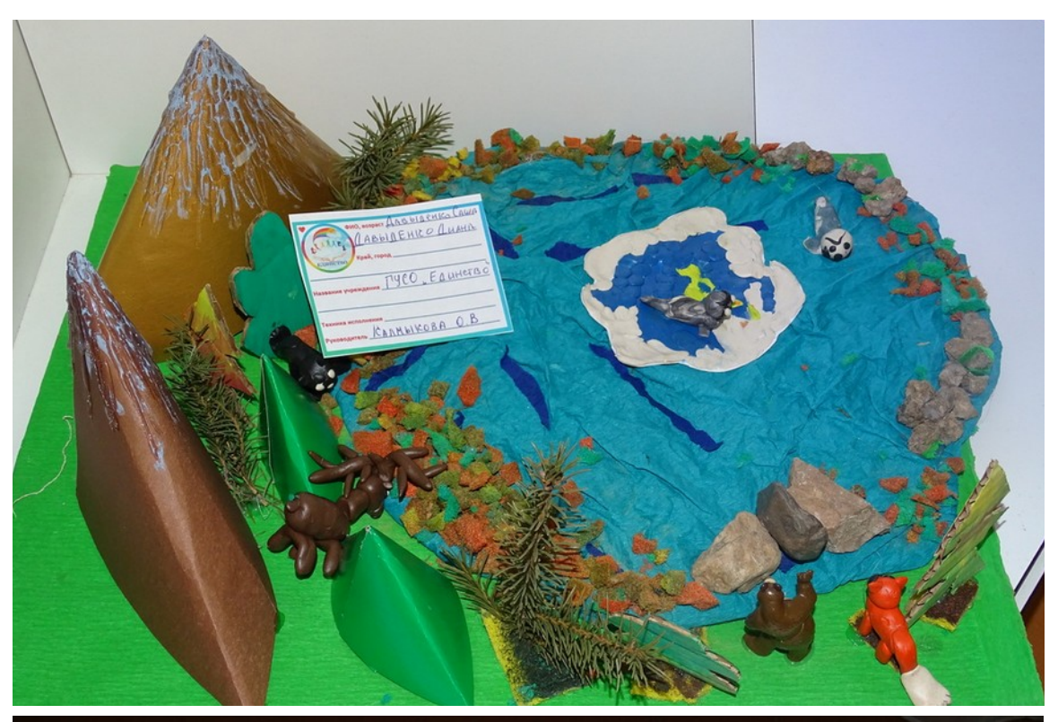
Spring 2021 Siberian Bridges Newsletter